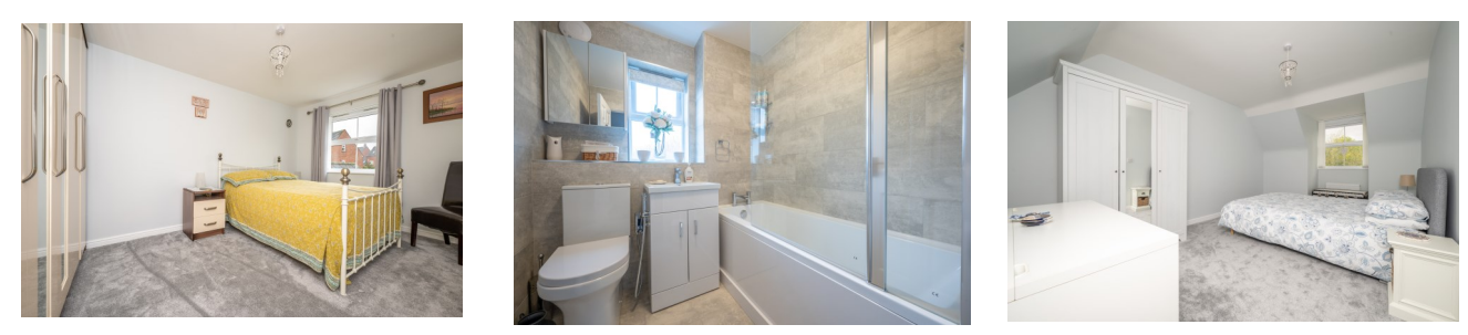
FAMILY BATHROOM / W.C. Obscure double glazed window to rear elevation, a white suite of panel bath with shower over, vanity unit with wash basin, close coupled WC and being fully tiled.

BEDROOM 2 (rear) 14' 6" x 9' 8" with double glazed window to rear elevation and central heating radiator.BEDROOM 3 (front) 8' 1" x 9' 8" with double glazed window to front elevation and central heating radiator.